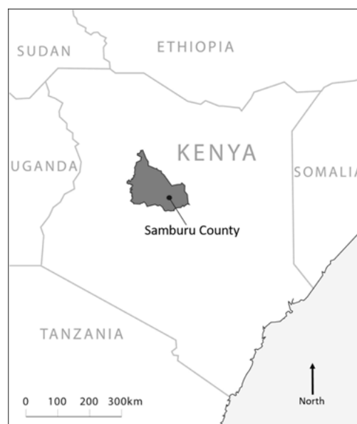
Figure 1. Location of Samburu, Kenya